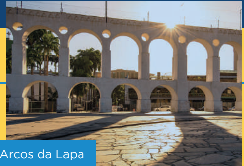
Arcos da Lapa

And last but not least for the explorers: Both the main bus terminal, from where one can visit almost every corner of this huge country, as well as the domestic airport are within a quarter of an hour from FGV by taxi. In-state attractions such as the beaches of Arraial do Cabo, Cabo Frio or Búzios, as well as small (former) fishing towns such as Angra dos Reis or Paraty and the nearby Ilha Grande can be reached by bus within few hours.